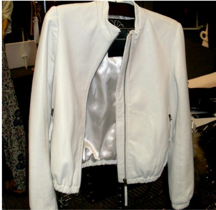
Perforated white leather jacket from 3rd and Army